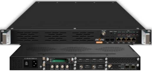
Redundancy Power Supply (optional)